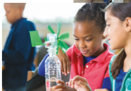
Supporting educational programs to engage the next generation