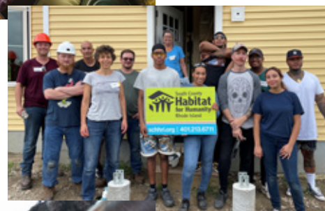
Joining forces with Habitat for Humanity to strengthen our community.