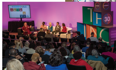
Collaborating for a more sustainable future with THINC30