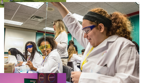
Bringing hands-on science learning to the next generation