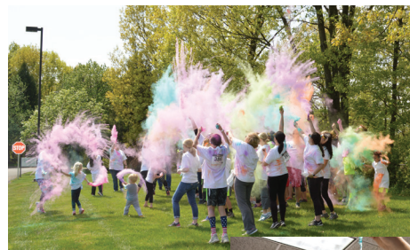
Partnering with United Way to strengthen our community

Our passionate employees have countless opportunities to take their talents to the communities where we live, work and play, by helping non-profits solve business challenges, raising funds for a good cause, sharing our excitement for science with the next generation, and inspiring a cleaner future.