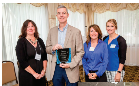
Joining forces with United Way of Franklin County to strengthen our community