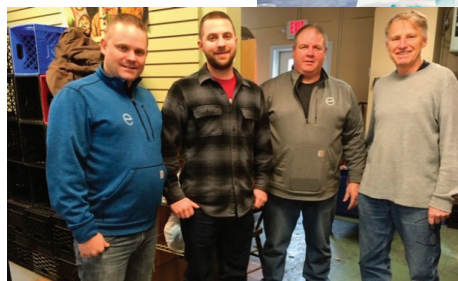
Working with Western Mass Food Bank to help those in need