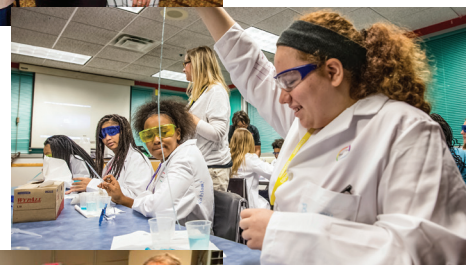
Bringing hands-on science learning to the next generation